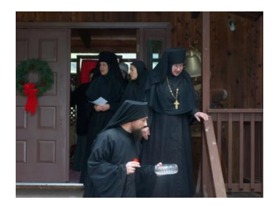
...and on to the rest of the monastery grounds.