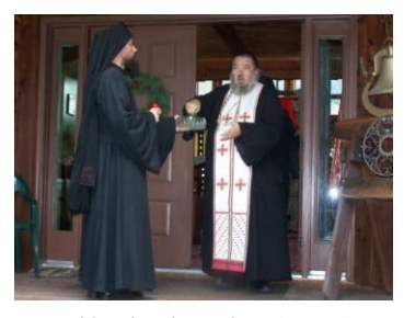
... blessing the main entrance to the house and chapel...